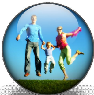
Family day on Sunday 4 July