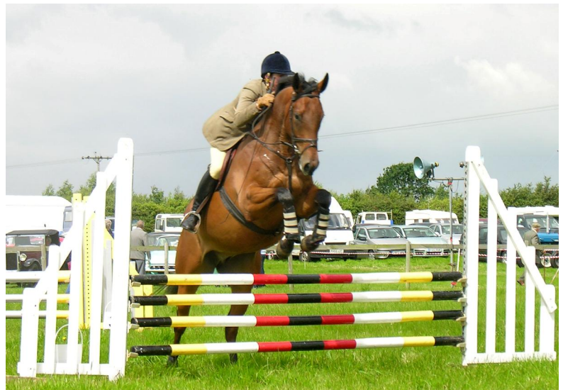
Thank you to the Show Committee for permission to use this photograph

Even if they are complaints, we want to know about them so that we can try and put things right. If there is a service you need and it isn't there—please do let us know—we are in an era of change and we might be able to help make a difference. We hope you enjoy the show and hope the Show Committee have another successful event.