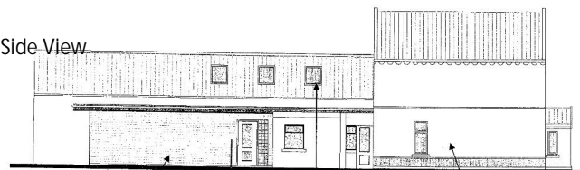
Proposed new building Dormer windows replaced with Velux The Ark - former school house